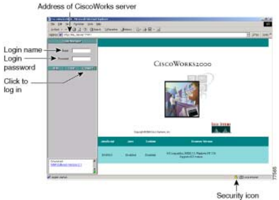
Figure 4-1 CiscoWorks Login Screen